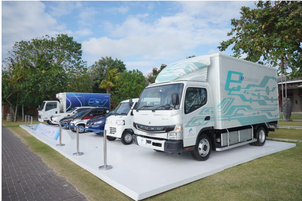
Commercial vehicles such as the FUSO eCanter will be run to support logistics and business operations in Bali