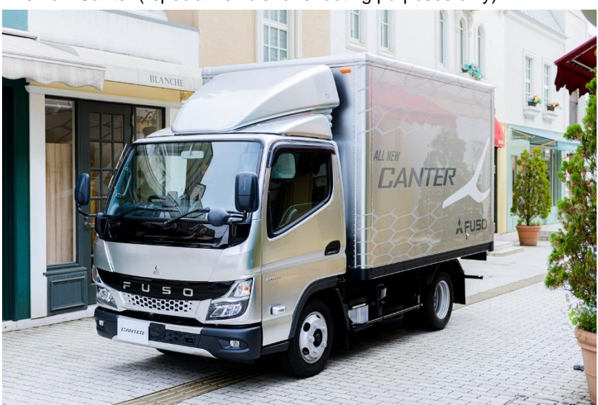
The Active Sideguard Assist feature newly installed in the new Canter

The new Canter (*special vehicle for shooting purposes only)