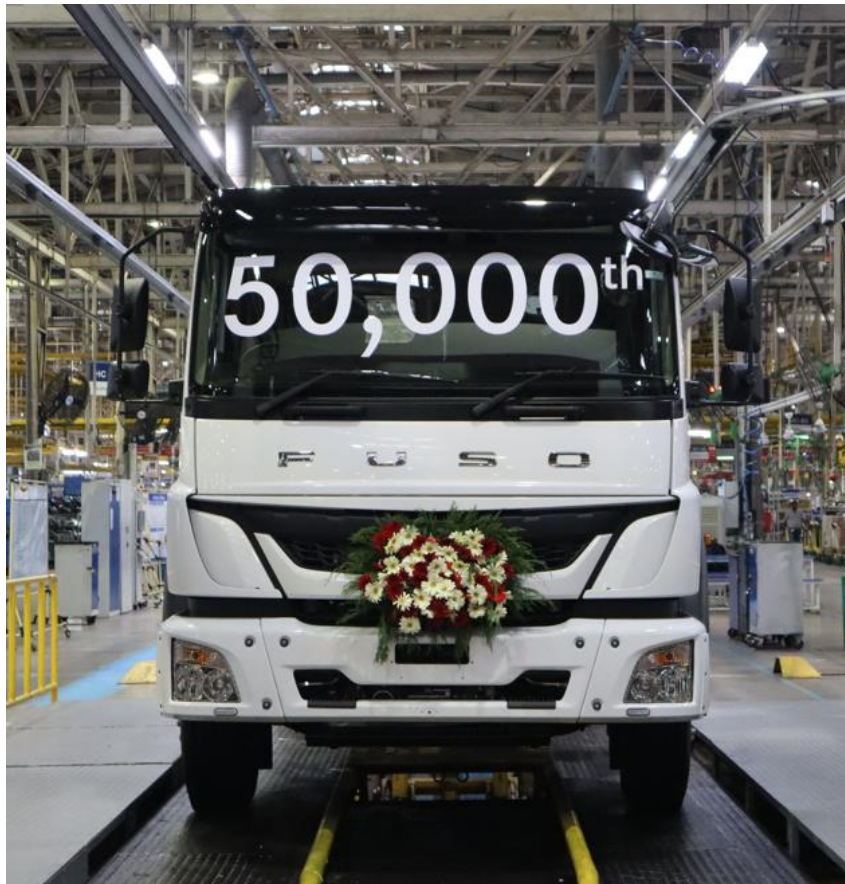
The 50,000 th export vehicle rolling off the production line

DICV’s remarkable growth has also been accompanied by a strong commitment to sustainability. The plant’s state-of-the-art facilities only rely on 100% recycled water, and are on course to achieve carbon free* operations by 2025. Solar panels located across the vast 430 acre plot are already contributing to this goal, with their 3.3 megawatt capacity. As with MFTBC’s Kawasaki Plant, carbon neutrality across the value chain is also a strategic focus at the Oragadam location. Together with DICV, MFTBC will continue to strive towards the Daimler Truck Asia vision “to develop mobility solutions to embrace a better life for people and the planet,” in the years to come.