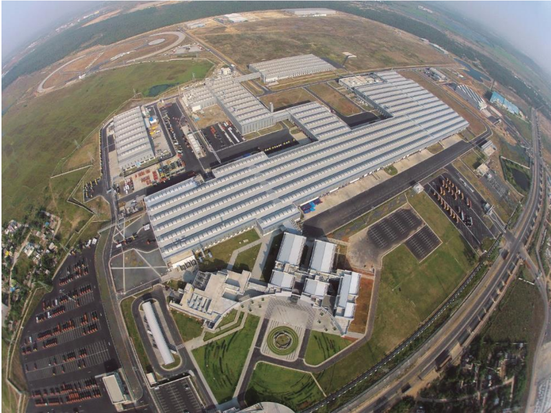
A birds-eye view of the Oragadam plant

*powered by energy that generates no carbon emissions in its production