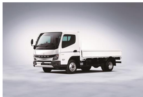
*Product images for illustration purposes only

In conventional leasing contracts, the regular payments are fixed at an agreed fee. FUSO Mileage Lease changes the status quo with a fee structure that consists of an adjustable, mileage-dependent bill that is combined with fixed monthly charge.